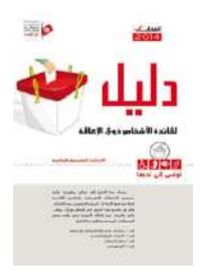
Guide of the elections of 2014 for people with disabilities