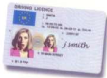
Current NI or GB Photographic Driving Licence