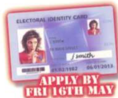
Electoral Identity Card