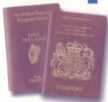
Valid British or Irish Passport