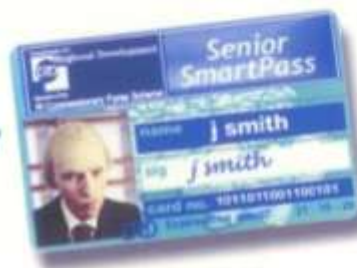
Translink Smart Pass