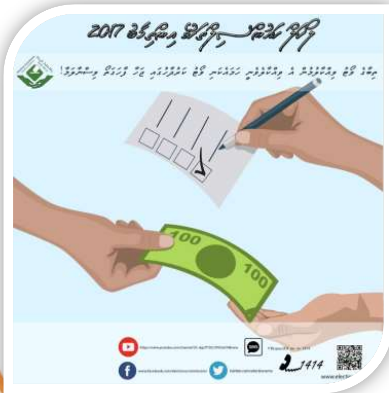
Local Council Election 2017 Vote Buying