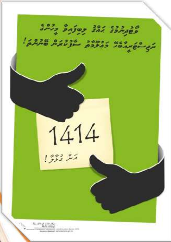
1414 Toll Free number