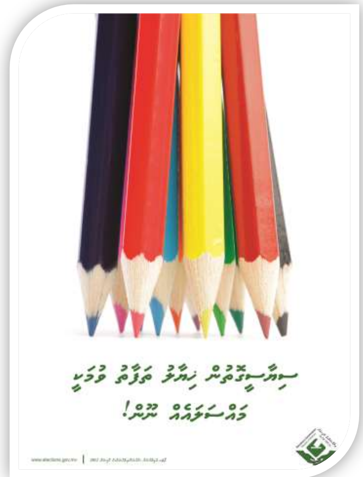
Politically having a different view isn't a problem