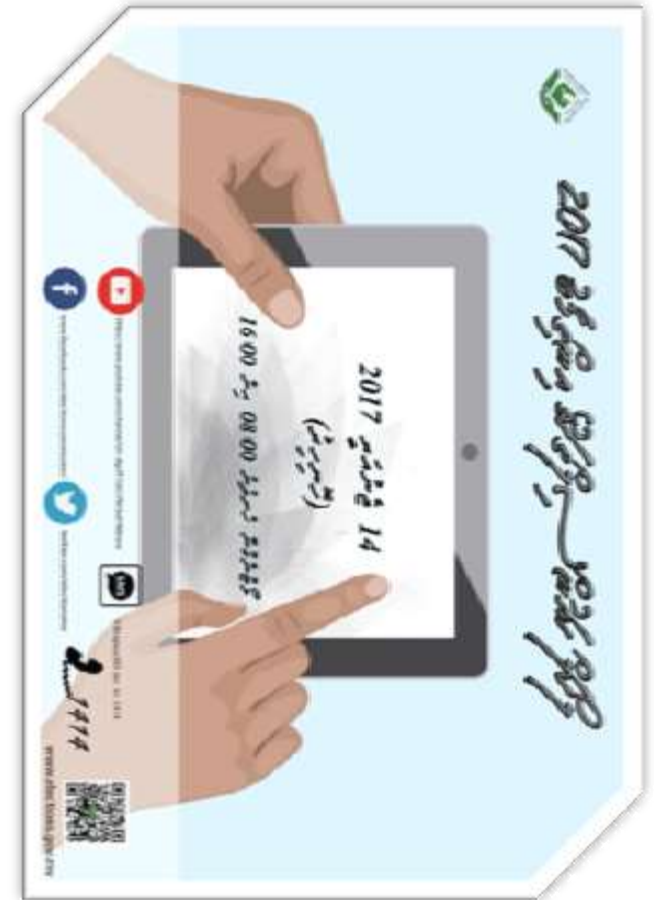
Local Council Election 2017 Election Day