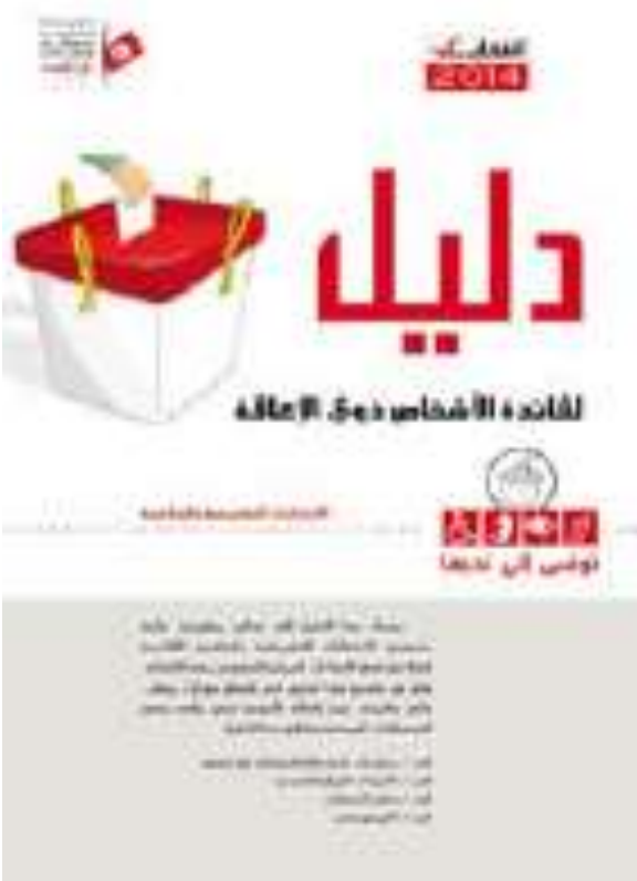
Guide of the elections of 2014 for people with disabilities