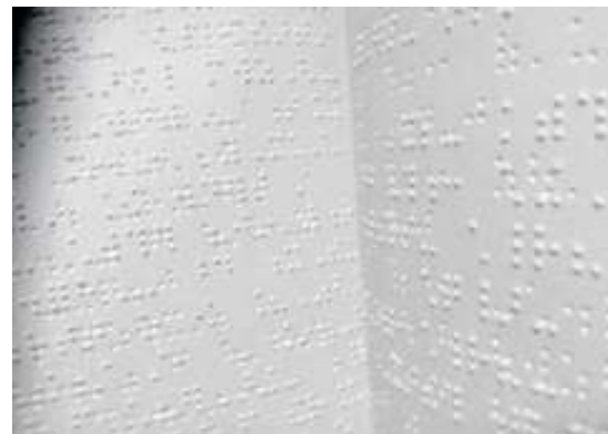
Manual on the elections of 2014 in the language of «Braille»